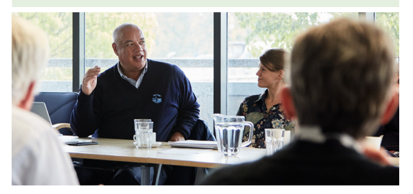
Are you or someone you know considering volunteering as a trustee for St Christopher's? Find out more <u>here</u>.